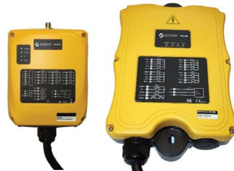
FLEX EM RECEIVER

The Flex EM receiver is available with 6, 10, 16, or 24 outputs for on/off control. It is equipped with more than 200 programmable functions to suit all types of applications.