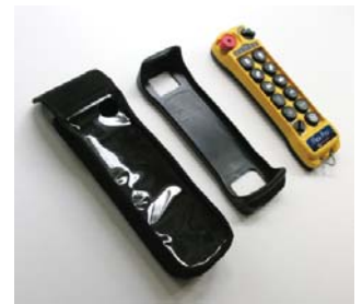
Protective rubber jackets and cases are available